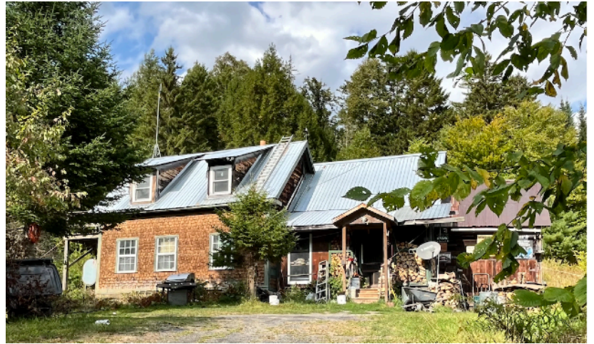
Jenerson Wheelock Farm - Dugar Brook Rd