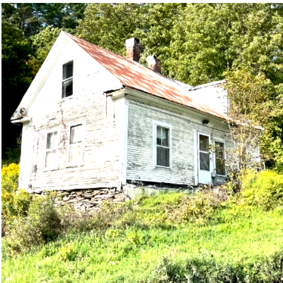
Calais Rd abandoned house