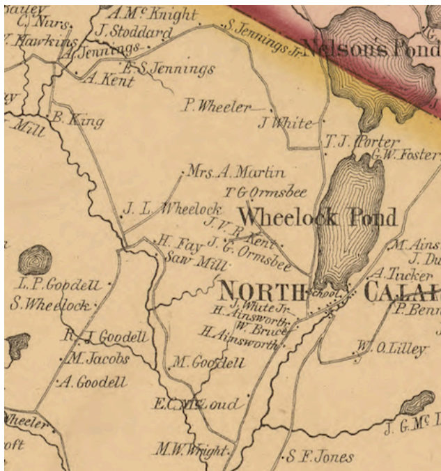
1858 Wallings Map

#10 Pond was called Wheelock Pond as seen on the 1800s maps, and later Mirror Lake, but that got changed to match its school district, #10 school. Mirror Lake Rd maintains the lake's second name.