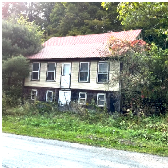
Calais Rd abandoned house