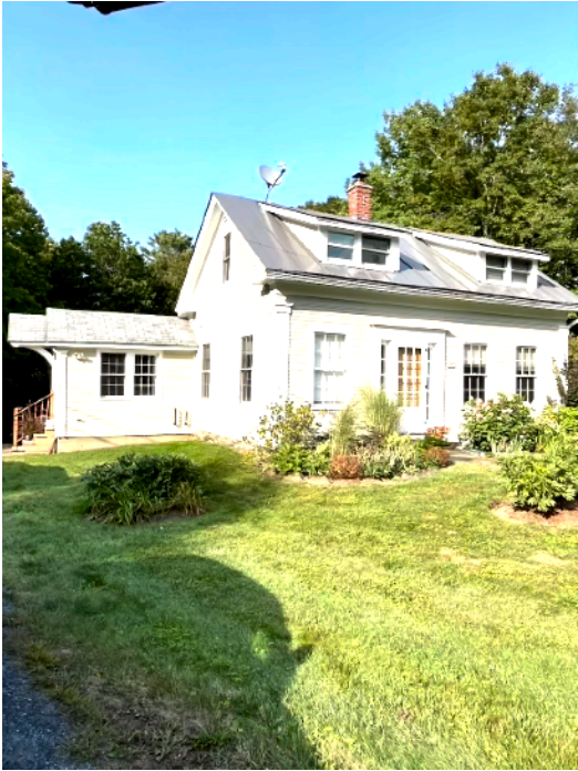
Thomas and Sally Ormsbee house - Mirror Lake Rd