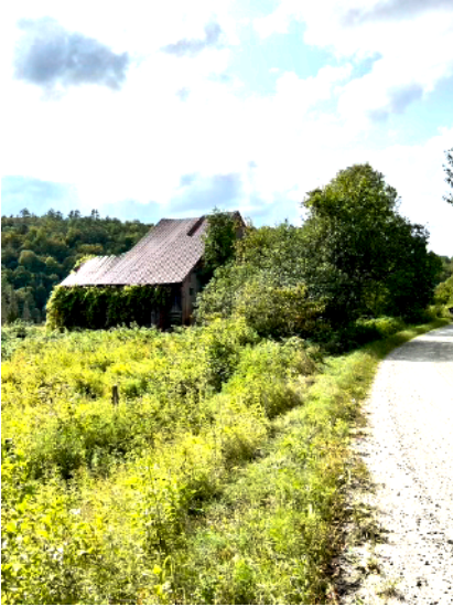
Moses Goodell's barn - Dugar Brook Rd - old house burned