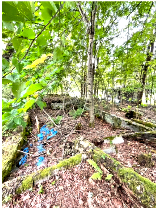
Martin cellar hole